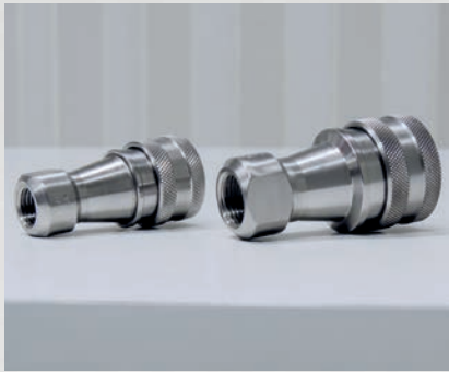
AUTOMATIC SHUT OFF VALVE

The G100 Series works on a simple push and pull principle with a self-locking arrangement ensuring a leak proof connection. When connected, the valve immediately opens and the gas (fluid) starts to flow. This series is mainly used for refrigerant gas charging and vacuum applications.