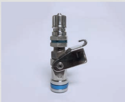
DOUBLE SEALING INSIDE

The G110 Series is an excellent choice for copper tube sealing in air conditioning, refrigerator and compressor production lines. This series is suitable for leak testing, gas charging and vacuum applications