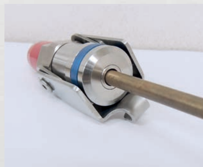
DIRECT CLAMPING STRAIGHT COPPER TUBES