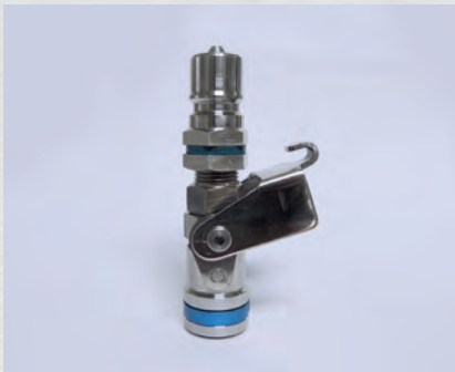
DOUBLE SEALING INSIDE

The G110 Series is an excellent choice for copper tube sealing in air conditioning, refrigerator and compressor production lines. This series is suitable for leak testing, gas charging and vacuum applications