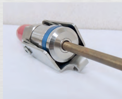
DIRECT CLAMPING STRAIGHT COPPER TUBES