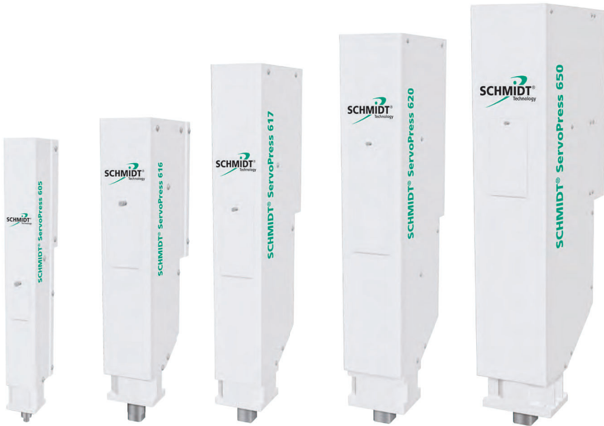
Press type 605